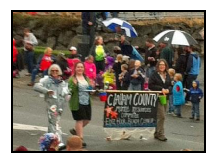
July 4<sup>th</sup> parade announcing the July 5<sup>th</sup> beach cleanup

<u>Summer Clean Ups:</u> Coordinated by MRC interns Emily Larson and Sarah MacDougald, summer beach cleanups were held on July 5<sup>th</sup> and July 26. On July 5<sup>th</sup>, volunteers collected 120 pounds of garbage, highly variable in content and indicative of 4<sup>th</sup> of July fireworks celebrations. On July 26, volunteers collected 45 pounds of garbage, which mostly consisted of cigarette butts.