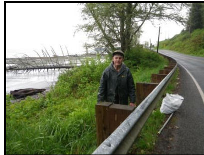
It all flows downstream: cleaning up the road near the Strait