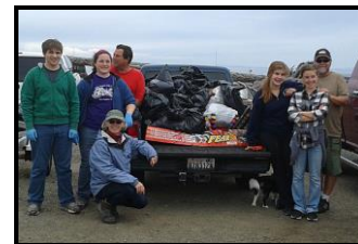
July 5 th cleanup