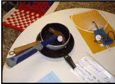
Frying pan and hammer