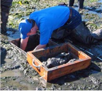
0.25m 2 quadrat at Jamestown

A 0.25 m 2 (50 cm x 50 cm) stainless steel quadrat frame was driven into the sediment 30 cm deep at each sampling location. The sediment from within the frame was removed using hand trowels and shovels and live-sieved in the field through a 12.5 mm screen to retain large invertebrates. All organisms retained on the screen were preserved in 500 ml jars filled with 10% buffered formalin. All samples were containerized and labeled separately for laboratory sorting and analysis.