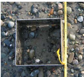
0.05m 2 quadrat at Dungeness

A 0.05 m 2 (22.5 cm x 22.5 cm) stainless steel quadrat frame was driven into the sediment 15 cm deep at each sampling location. The sediment from within the frame was removed using hand trowels and hands, then placed in a 3.5-gallon bucket and preserved in 10% buffered formalin. In the laboratory, the sediment samples from the 0.05 m 2 quadrat were dead-sieved through a 1.0 mm screen to retain small invertebrates (primarily Annelida and Arthropoda).